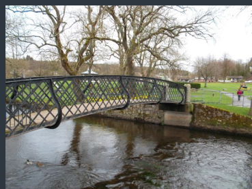
Colliston Park, Dalbeattie