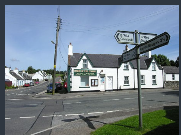
Haugh of Urr