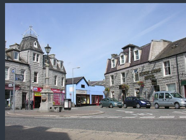
Dalbeattie Town Centre